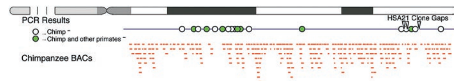
Fig. 2. Distribution of chimpanzee BESs on human chromosome 21 and detection of human chromosome 21-specific STSs in the chimpanzee genome. BAC clones based on the BES alignment are positioned on the human chromosome 21 sequence and shown as red bars (the shortest bar denotes 40 kb). Positions of human STSs that were not detected in the chimpanzee genome are shown in the middle bar with open circles. Filled circles designate STSs that were detected only in human DNA (see text and notes for details). Positions of clone gaps in the human chromosome 21 sequence are also shown as vertical arrowheads.